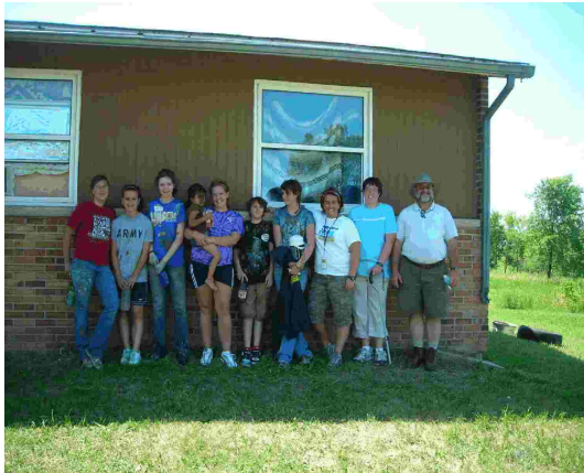
Youth Mission Trip

gratitude for allowing us the use of their church van at no cost for the trip. You will never know what this experience has meant for each of us. We are so grateful to be part of this parish family!