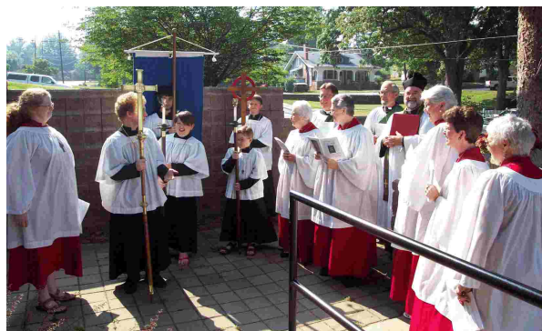
85 th Anniversary Celebration

As we enjoy the rest of the summer, please remember that we always need hosts for the coffee hours. Please check the sign-up sheet in the Undercroft.